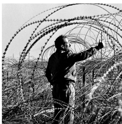
The Shouting Fence: a man greets relatives across the no-man's-land between Rafah and Egypt, 1984