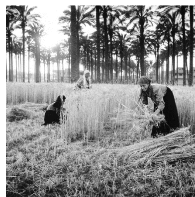
Scything wheat, Deir El-Balah, 1993