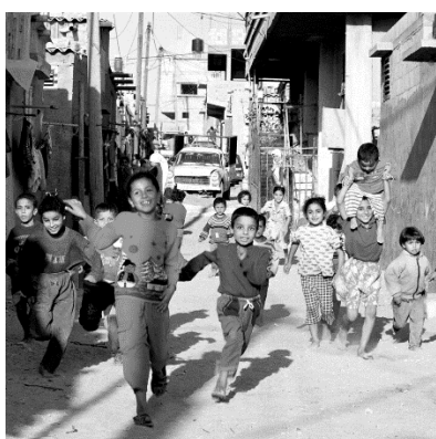
Children (1990s)